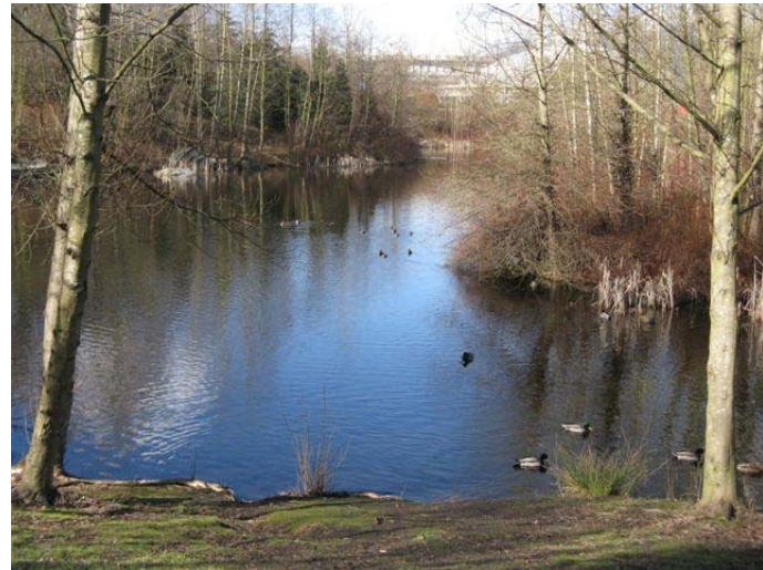
Enhanced view of pond