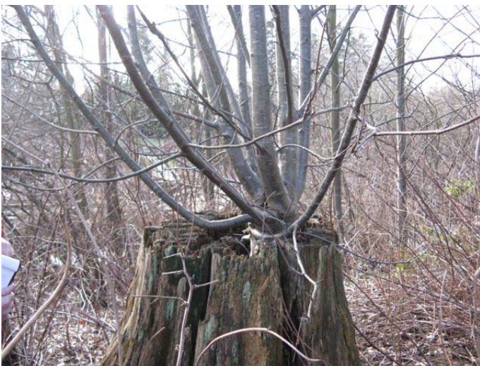
Rotted stump provides nutrients and support to younger tree