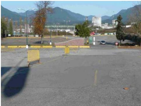
And more asphalt.