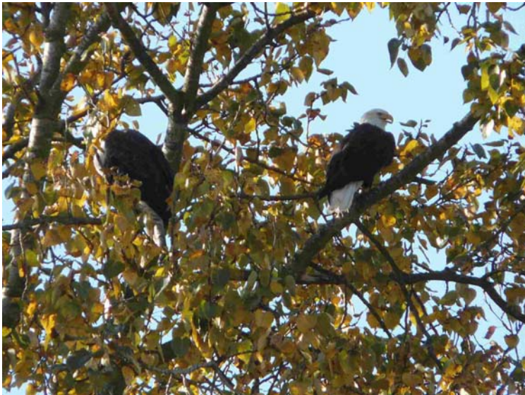
Eagles in cottonwood trees at north end of racetrack on McGill Street.